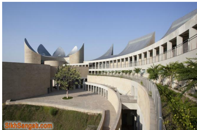
VIRASAT –E-KHALSA, SHRI ANANDPUR SAHIB

On the left bank of the Sutlej river, about 97 kilometers from Chandigarh & about 45 kilometers from Rupnagar town, is situated Shri Anandpur Sahib..The town of Shri Anandpur Sahib was founded by Shri Guru Teg Bahadur Ji, the 9th Guru of Sikhs. The Guru had left Baba Bakala in the Amritsar district and went to Patna Sahib and Eastern Parts of India for spreading the message of Sikhism .Guru Ji purchased land for setting up a town in the Shiwalik hills with picturesque background.